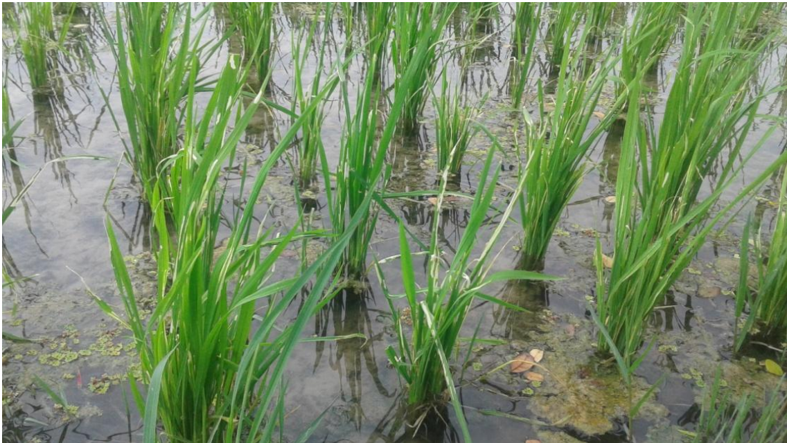
Caseworm damage at Coimbatore.

Pest Status: Low to moderate incidence of caseworm at Satyanagar and leaf folder ay Narasipuram (4-12 % damaged leaves per hill).