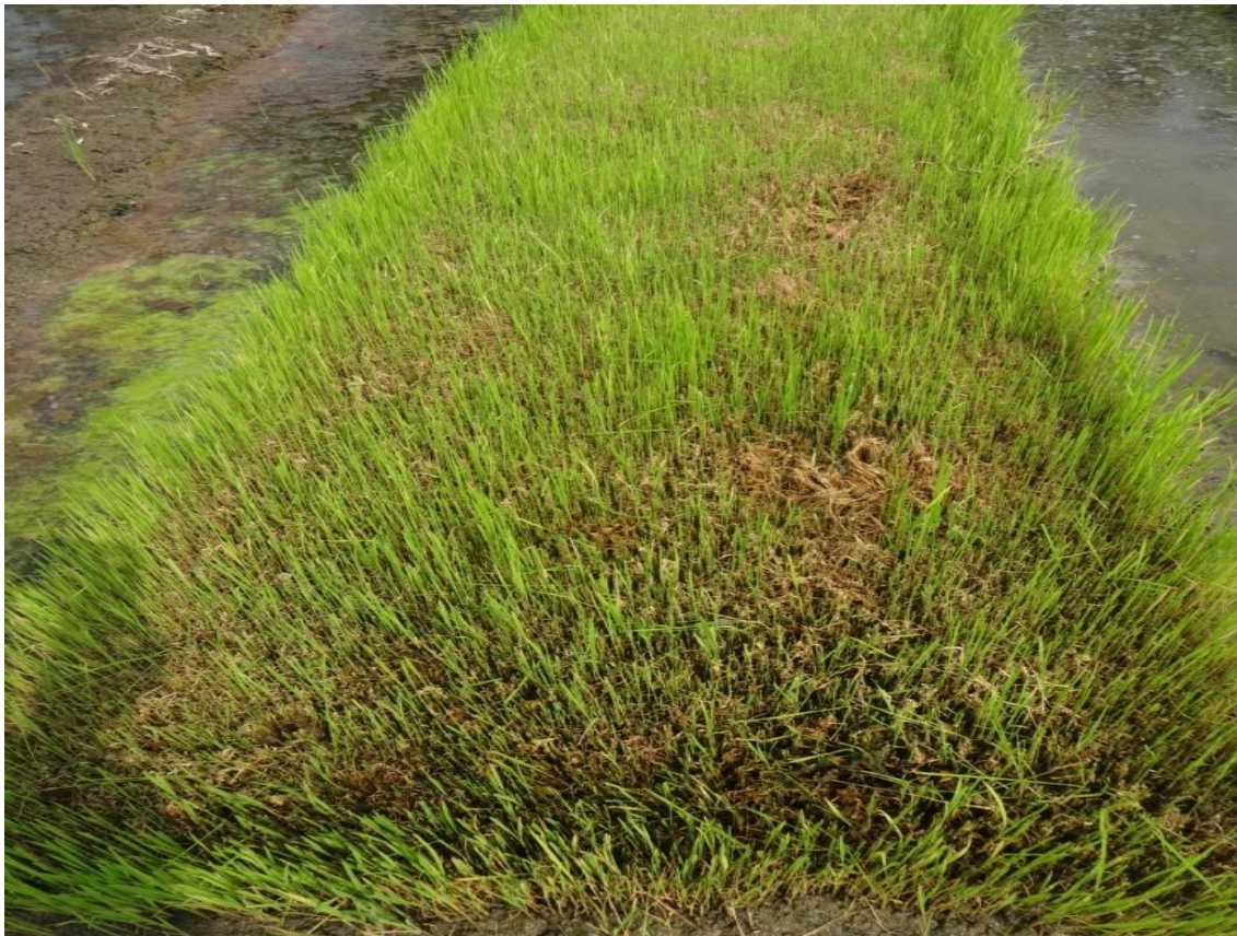
Swarming caterpillar damage in paddy nursery

Other information: Brown spot (8%), Blast (10%), and BLB (10%).